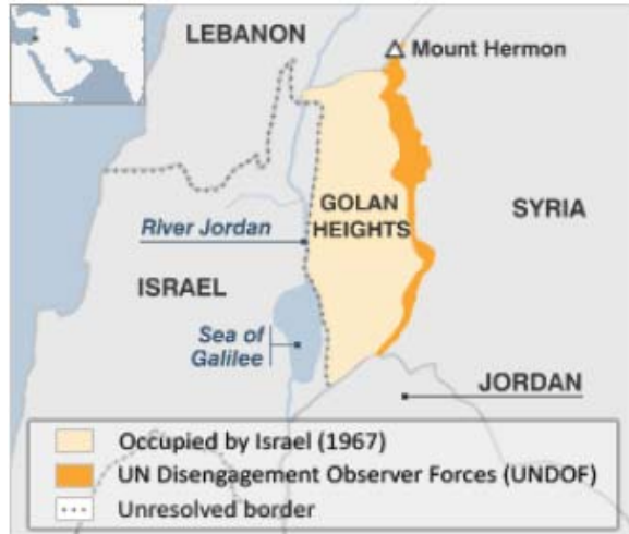
Figure 2: The Disputed Golan Heights

Syria's 22,517,750 population is mainly Arabs (90.3%) and 9.7% Kurds, Armenians, and other. Arabic is the predominant language. 74% of the population are Sunni Muslim, 16% other Muslim (includes Alawite and Druze), 10% Christian and some tiny communities of Jews.