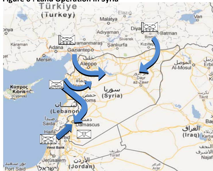
Figure 6 : Land Operation in Syria

An invasion of Syria would be a combination of forces coming over the Turkish-Syrian border taking control of the northern parts of Syria as well as moving south as a strategic reserve to the amphibious forces. At the same time an amphibious force, which could be the US Marine Corps, would land on the shores of Syria's beaches and at its harbors, depending on access, and start moving south towards Damascus. This would be synchronized with the rebel groups in Syria to assist in the battles. Depending on availability as well as the hostile environment it could be an option to use airborne units as well around the Damascus area or if Israel is willing to engage forces from the Israeli-Syrian border. See Figure 6. As with Option 1, one could argue that Iraq could be used for a land operation against Syria. This would be a possible solution, but the logistics together with most likely poor to none host-nation support this would be a very large-scale operation. Added to this would also be, as argued previously, the threat towards a coalition from rogue elements in Iraq.