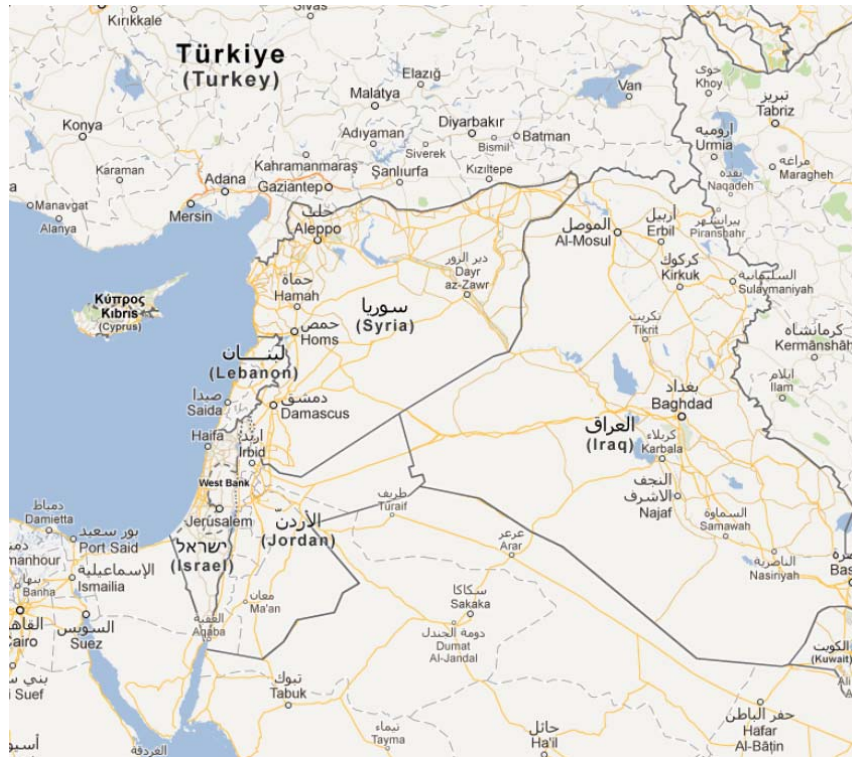
Figure 1: Syria in the Middle East

Syria is 185,180 square kilometer in size, about 40 per cent the size of Iraq, and has 2253 km land borders and 193 km of coastline. Syria's terrain mostly consists of desert plateau, a narrow coastal plain and mountains to the West. The highest point is Mount Hermon (2814m), which is