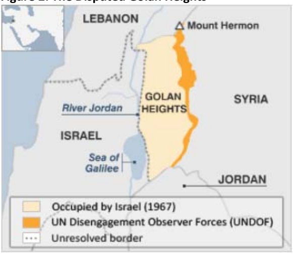
Figure 2: The Disputed Golan Heights

Syria's 22,517,750 population is mainly Arabs (90.3%) and 9.7% Kurds, Armenians, and other. Arabic is the predominant language. 74% of the population are Sunni Muslim, 16% other Muslim (includes Alawite and Druze), 10% Christian and some tiny communities of Jews.