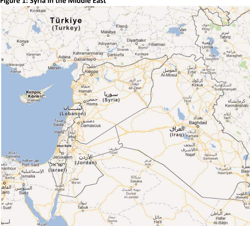
Figure 1: Syria in the Middle East

To give the setting of the environment of which a potential military intervention would have to operate within a short description of Syria is necessary. Syria is situated in the Middle East between Turkey, Iraq, Jordan, Israel, Lebanon and bordering the Mediterranean Sea. See Figure 1.